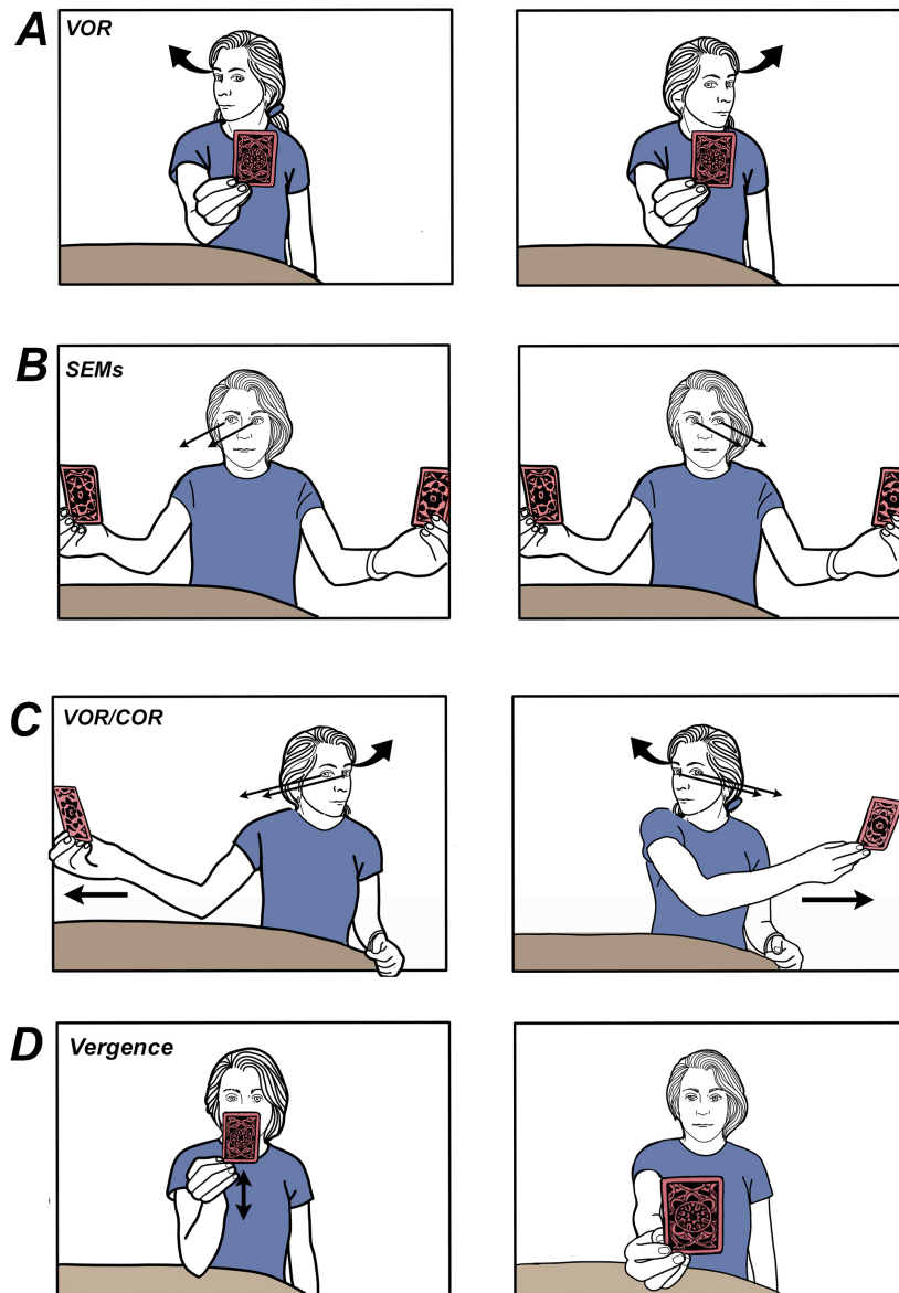
Fig. 3. Gaze stabilization exercises. Perform these exercises by moving the target and/or head as fast as you can while maintaining clear focus on the target. A) The VOR is exercised by rapidly rotating your head while maintaining your eyes fixed on an immobile target. B) Saccadic eye movements are performed by moving the eyes horizontally between two stationary targets while keeping the head still. C) The VOR and COR exercises are performed by moving the head and target in opposite directions horizontally while tracking the target with your eyes. D) Vergence is exercised by tracking a moving target back and forth at eye level starting at about 2 inches from your nose and extending as far as possible. Morimoto et al. (9) recommends performing each of these exercises for five minutes. The entire routine takes 20 minutes and should be performed daily for 3 weeks.

Lastly, because research consistently finds that adding gaze stabilization exercises to conventional balance rehabilitation results in significantly reduced fall rates (14), these simple, cost-effective, home-based exercises should be considered by everyone, particularly people who performed poorly during the Dynamic Visual Acuity test. When you consider that nearly 900,000 Americans are hospitalized annually as the result of a fall, it seems that performing a few simple eye exercises just a few times per week is a small price to pay to improve balance, walking speed, and mental acuity as we age.